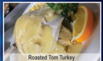
Roasted Tom Turkey

Serving Traditional and Home Cooked Meals for 29 Years All Dinner Entrees come with Dinner Rolls, Soup and Salad Bar and Choice of Potato or Vegetable.