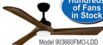
Model 903660FMO-LDD Matt Black with Walnut Blades