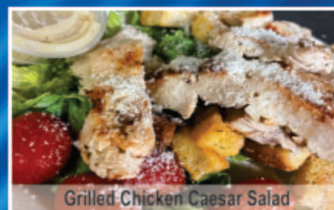
Grilled Chicken Caesar Salad