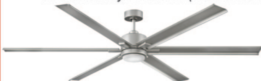
Model 900982FBN-LDD Brushed Nickel w/Brushed Nickel Blades