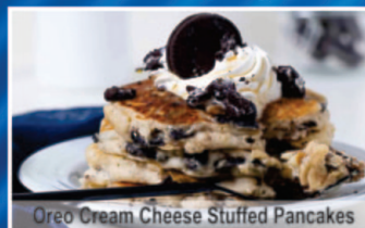
Oreo Cream Cheese Stuffed Pancakes

Whether it's breakfast, lunch, dinner or a late night snack, stop by and try our wide variety of menu items.